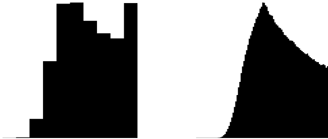
Figure 1: Left: Probability of largest part i for partitions of k = 10 under \pi_{q,t} with q = 4 , t = 2 . Right: Probability of largest part i for partitions of k = 100 under \pi_{q,t} with q = 4 , t = 2 .

steps for arbitrary k . In the computations above, the distance to stationarity after one step of the auxiliary variables is 0.093 (within a 1% error in the last decimal) for k = 10, \dots, 50 . For larger k (e.g., k = 100 ), the Metropolis algorithm seemed to need a very large number of steps to move at all. This is consistent with other instances of auxiliary variables, such as the Swendsen–Wang algorithm for the Ising and Potts model (away from the critical temperature; see [9]).